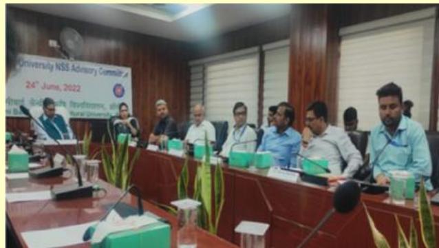
Fig. 5: Meeting of NSS Advisory Committee

responsibility of its maintenance during the degree programme.