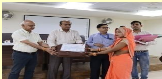
Fig. 13: Distribution of Certificate among participants

seven lectures were delivered emphasizing over cultivation of vegetables, seed production, packaging, marketing, processing, IPM , irrigation management, pollination, role of mulch in cucurbitaceous vegetable production, etc (Fig. 13). Certificates and bags were also provided to farmers. (Arjun Lal Ola, SS Singh, A.K. Pandey, M.M. Dobriyal)