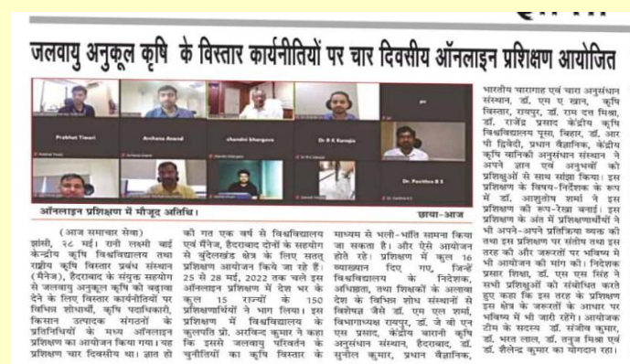
Fig. 12: Media Coverage by local News Paper

This online training was organized in collaboration with MANAGE, Hyderabad by virtual mode for agriprofessionals, extension functionaries, students and field level extension workers during 25-28 th May, 2022 (Fig. 12). More than 110 trainees from different states registered and e-certificate were sent (Ashutosh Sharma, Sanjeev Kumar, Bharat Lal, Tanuj and Shailendra Kumar).