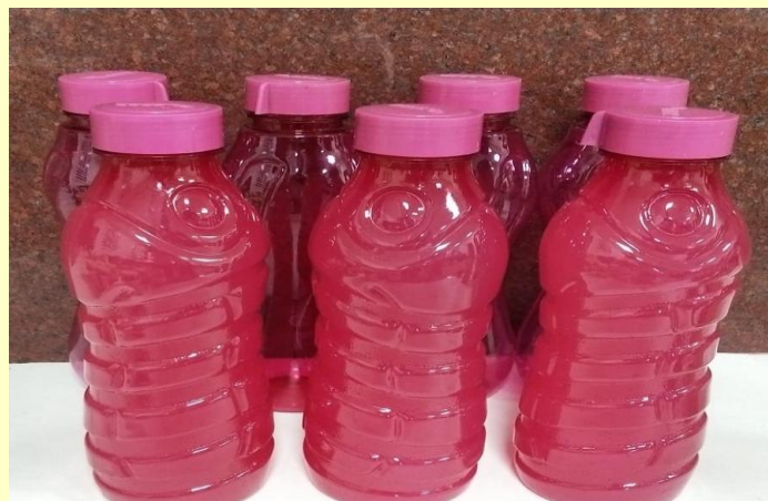
Fig. 3: Pomegranate nectar without artificial colours & flavours

A recipe for the development of pomegranate nectar was standardized for commercial sale in the department of Postharvest Technology. As per FSSAI specification, nectar is a beverage that contains not less than 20 % fruit juice or pulp, 15% total soluble solids and not more than 1.5 % titratable acidity as citric acid (Fig. 3). White and red fleshed pomegranate varieties were procured from the Fruit Science demonstration farm of the university. The white-fleshed varieties were high in TSS (sweetness) and the red-fleshed varieties had an attractive deep red colour. The blend of juices from these varieties had the desired sweetness, colour, flavour and Overall acceptability on a 9-point Hedonic scale (Ghan Shyam Abrol, Ashwani Kumar and Gaurav Sharma).