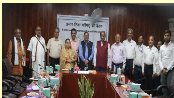
Fig. 18: Second Extension Education Council Meeting