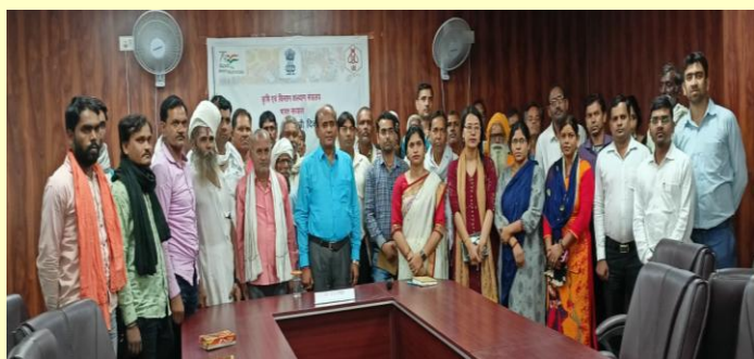
Fig. 11: Incampus Training of Honeybee growers and farmers