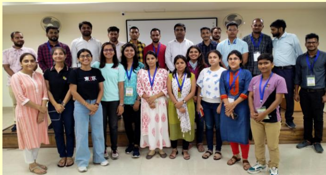
Fig. 15: Inaugural session of workshop