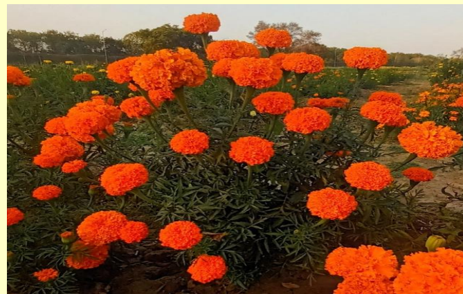
Fig. 2: Flowering of African marigold cv. 'Pusa Narangi Gainda'

that flowers per plant (47.95) were maximum with application of 150 kg/ha nitrogen and 100 kg/ha each of phosphorus and potassium (Figure 1). Similarly, flower yield per plant and flower yield per hectare (556.06 g and 15.87 t/ha) were also recorded maximum with application of 150 kg/ha nitrogen and 100 kg/ha each of phosphorus and potassium. (Priyanka Sharma, Gaurav Sharma & Y. Bijilaxmi Devi).