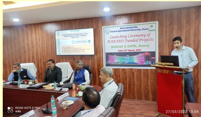
Fig. 17: Innauguration of the Project

Extension Project Inauguration: NABARD funded project entitled “Integrated Platform for Agri-preneur A Force multiplier forum of Farmers-Consumers-Entrepreneur” was inauguration of by G.R. Chintala (Chairman, NABARD) on 27 th March 2022 (Fig. 16). This project aims at providing visibility to the products of SHGs, FPOs and agripreneurs with the technical backup of ICT enabled platform i.e. Android app where each stakeholders can showcase their products and other details. The period of the project is two years and will be operative in three districts of Bundelkhand. (Tanuj Mishra, Sanjeev Kumar, Shailendra Kumar & Arpit Suryawanshi).