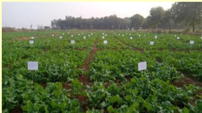
Fig. 1: Field trial of Rapeseed-Mustard

This experiment was conducted in campus, during Rabi 2021-22 under AICRP-Rapeseed-Mustard to evaluate the effect of irrigation, microbes and their combination on the growth and seed yield of mustard. The experiment comprising 18 treatments was conducted following a split-plot design with 3 replications (Fig. 1). The variety 'Giriraj' was sown following standard row and plant spacing. The post-harvest data is being recorded. (Artika Singh Kushwah).