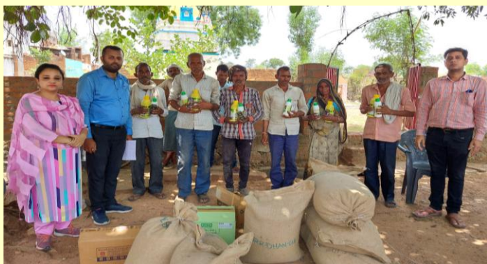
Fig. 8: Distribution of critical inputs among farmers

FLDs is being conducted in the fields of a total of 12 farmers in village Naykheda of Babina block, Jhansi district under the Scheduled Caste Sub-Plan funded by ICAR-IIPR, Kanpur on 25 th June 2022 (Fig. 8). Information about improved cultivation practices of aerobic rice that can perform well under less water along with seeds of aerobic rice variety D.R.R. 42 and D.R.R. 44 and nano-urea and herbicides such as pendimethylene and bispyribac sodium were distributed. (Gunjan Guleria, Nishant Bhanu and M. K Singh).