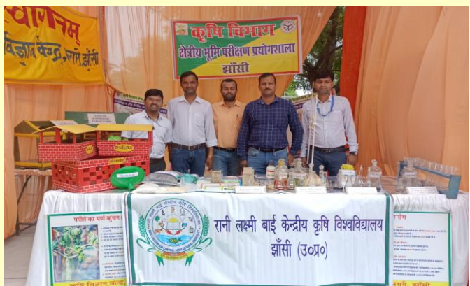
Fig. 16: University participation in the exhibition, Jhansi