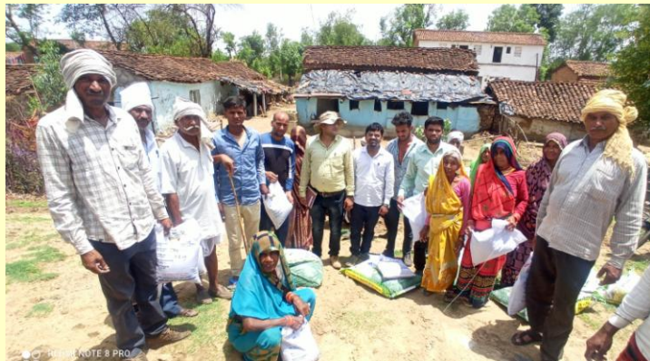
Fig. 7: Distribution of Seed and Fertilizers

FLDs among 121 farmers of Schedule Caste from village-Simardha & Khaikheda of district Lalitpur Uttar Pradesh were organized where inputs like Urd seed (IPU13-1) and Fertilizer (Single Super Phosphate-one bag) were distributed for demonstration purpose on one acre of land (Kharif-2022) sponsored from ICAR-IIPR, Kanpur on 22 June 2022 (Fig. 7) (Meenakshi Arya, Anshuman Singh, Arpit Suryawanshi and Sanjeev Kumar).