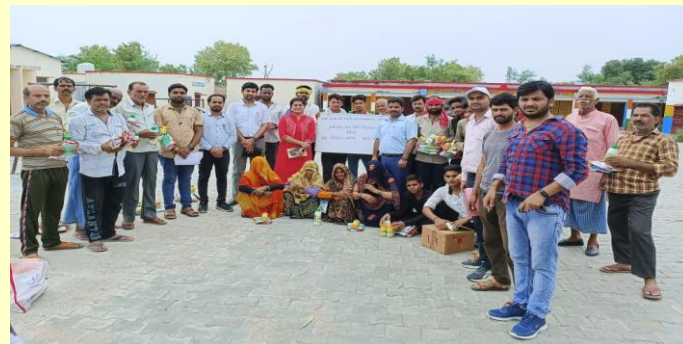
Fig. 9: Distribution of seed & agri-inputs among farmers

Jhansi (25) and Datia (25) district (Fig. 9). The training on Crop production technology of Sesame was also conducted on 30 June 2022 in the villages in which lectures were delivered by the scientists on various aspects (Artika Singh, Vaibhav Singh, Bharat Lal and Ashutosh Kumar)