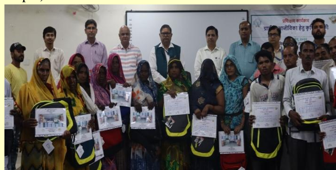
Fig. 14: Distribution of Certificate

The Training was conducted during 15-20 th June, 2022 for the farmers in the campus under RKVY through the project Establishment of Hi-tech Nursery for Quality Planting Material of Agroforestry and Plantation Trees in Bundelkhand Region of U. P. Skilled information on forest trees for agroforestry, nursery raising & plantation methods about the various multipurpose tree species like neem ( Azadirachta indica ), teak ( Tectonagrandis ), Gmelina ( Gmelinaar borea ), kadam ( Neolamarckia cadamba ), etc. including bamboo species available in the region. (Drs. Prabhat Tiwari, Manmohan Dobriyal, Ram Prakash Yadav, Priyanka Sharma, & Garima Gupta).